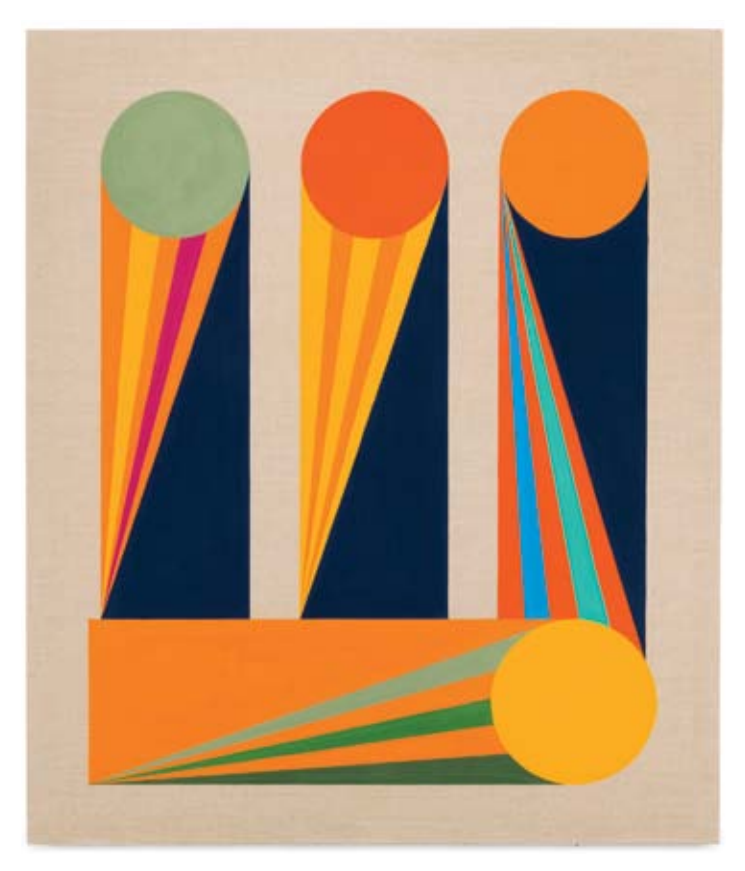
Eamon Ore-Giron, top: Night Bloom , 2015, flashe on linen, 17 x 12 inches; bottom: Roman Blues I , 2015, flashe on linen, 66 x 56 inches