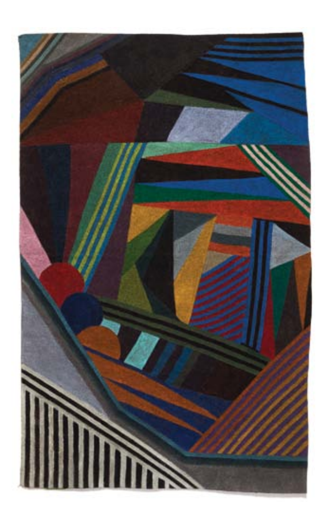
Jeffrey Gibson, opposite page: Painted Blanket 1, 2011, acrylic on recycled wool army blanket, 62^{3}/4 \times 37 inches; this page: Painted Blanket 2, 2011, acrylic on recycled wool army blanket, 62^{1}/2 \times 40^{1}/4 inches