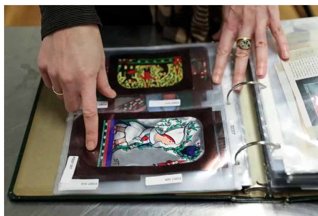
Foster's work, drawn in old ballpoint pen, shimmer in person.

But it also highlights how a good story can make people want in on artwork that has long been ignored. That's reflected in the price of the drawings, which the antique shop was selling for roughly $5 and which now sell for $1,000 — an almost 20,000% increase.